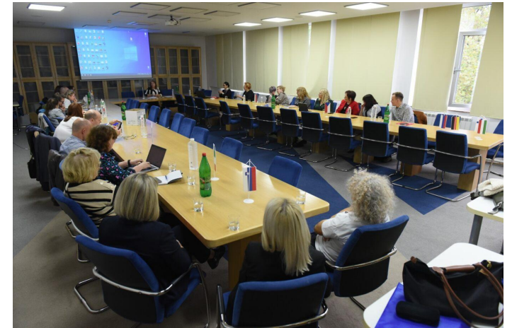
( Serbia, Scientific Meeting 2023)